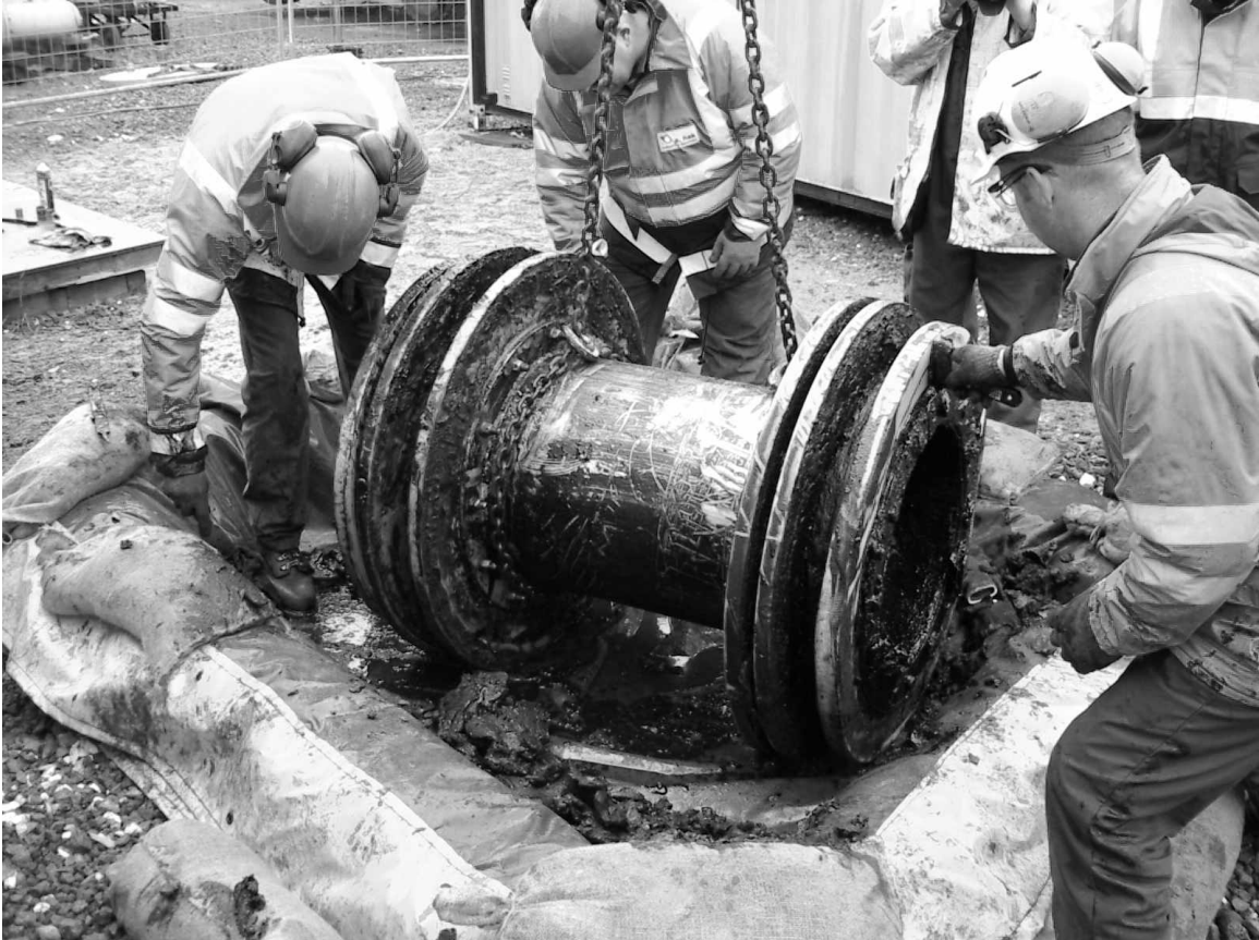
Figure 3: Inspecting the Cleaning Pig