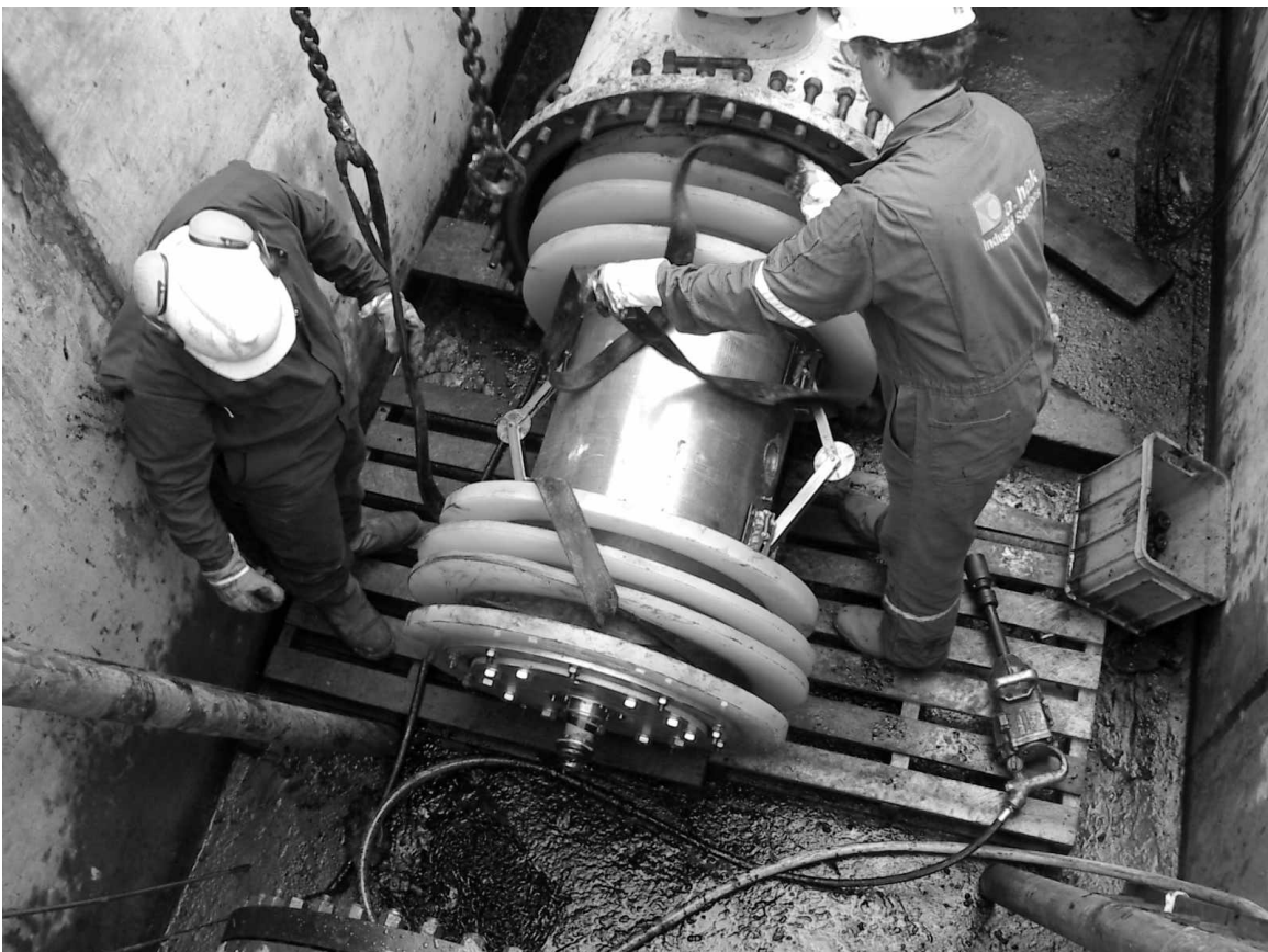
Figure 4: Manoeuvring the Ultrasonic Pig into the Pipeline