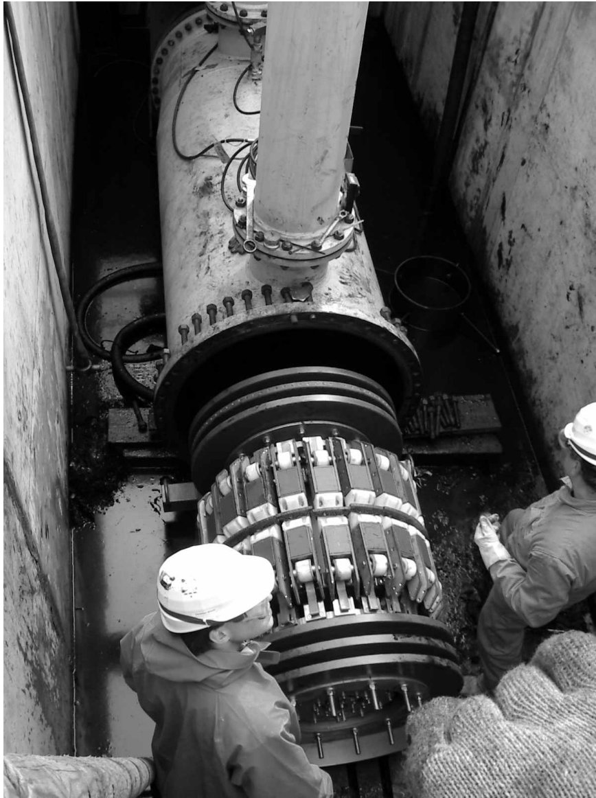
Figure 5: Manoeuvring the Magnetic Flux Leakage Pig into the Pipeline